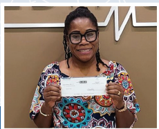
IHUOMA Grand Canyon University