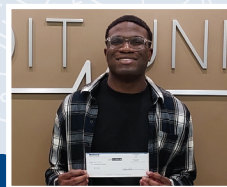
EMETU U of H College of Pharmacy